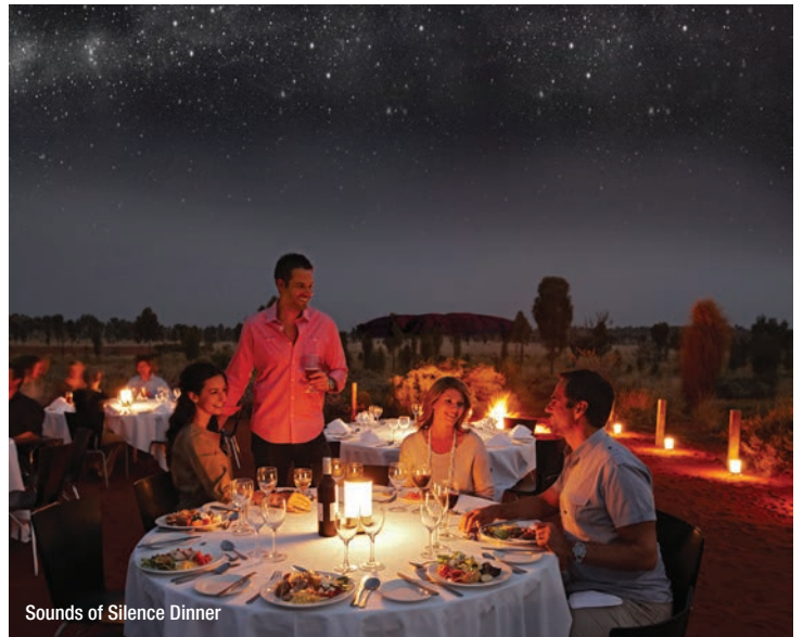
Sounds of Silence Dinner