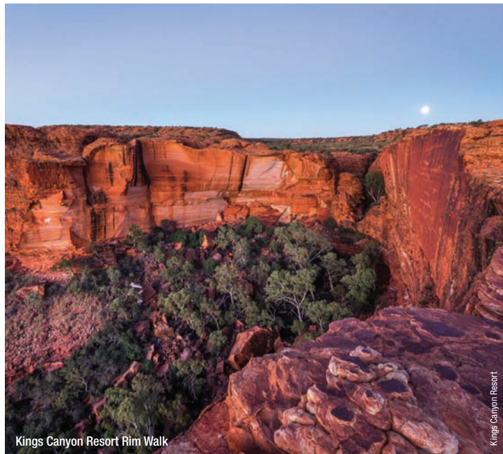
Kings Canyon Resort Rim Walk