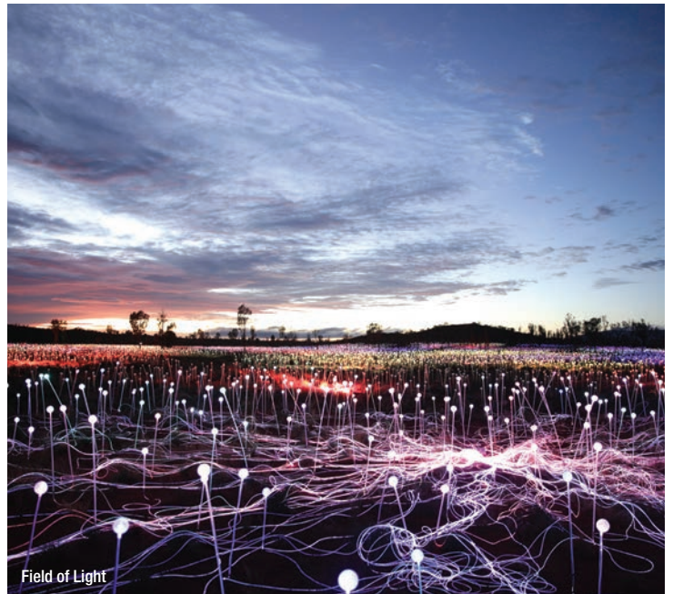
Field of Light